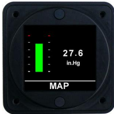
Single Manifold Pressure

This document set is applicable to the following part number configurations: